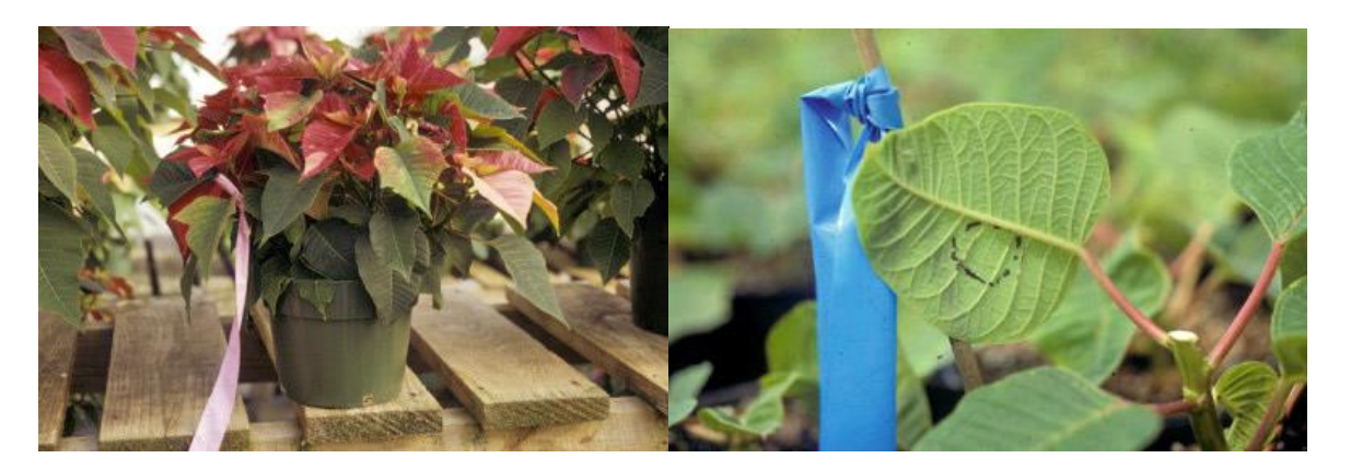
Figure 2: Use of Pest Infested Indicator Plants.

Use the first plant showing pest symptoms as a tagged indicator plant to monitor effectiveness of treatments (biological control agents or chemical controls) or to track pest development. Mark and number the indicator plants with a colored flag or flagging tape so you can find them each week.