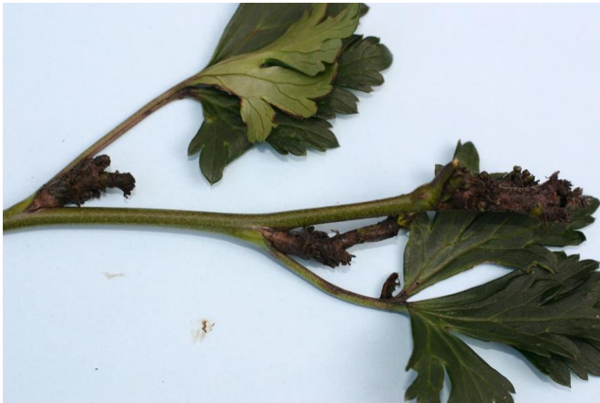
Figure 4: Cyclamen mite injury on Aconitum. Note blackening of buds.

Broad mites have a wide host range and can feed on African violets, ageratum, begonia, chrysanthemum, cyclamen, dahlia, gerbera daisy, gloxinia, hibiscus, English ivy, jasmine, impatiens, New Guinea impatiens, lantana, lysimachia, marigold, snapdragon, verbena, and zinnia. Broad mites can also infest vegetable bedding plants especially peppers. They may be spread among a