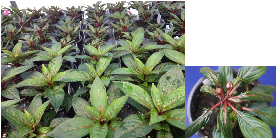
Figure 11 & 12: Outer leaves turn downward and growing point is killed on this New Guinea Impatiens.