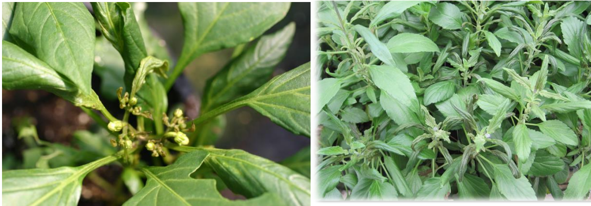
Figures 5 & 6: Outer leaf edges turn downward and terminal buds are killed on pepper and saliva.

Broad mites inject a toxin from their saliva as they feed. Leaves become twisted, hardened and distorted with bronzed lower leaf surfaces. Young terminal buds can be killed, especially if high broad mite populations are present. Broad mite feeding prevents normal leaf expansion and causes a downward puckering along the leaf edges. Broad mite injury may resemble herbicide injury, certain nutrient deficiencies (boron or calcium), cold temperature injury, or several physiological disorders. Broad mite injury often occurs suddenly and may be spotty in distribution. This damage may persist long after the mites are gone.