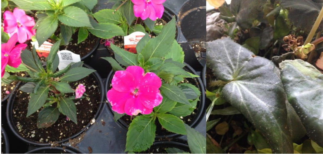
Figure 9 & 10: Feeding damage to impatiens and begonias.