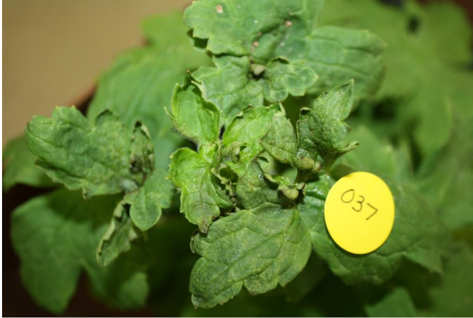
Figure 3: Cyclamen Mite Damage.