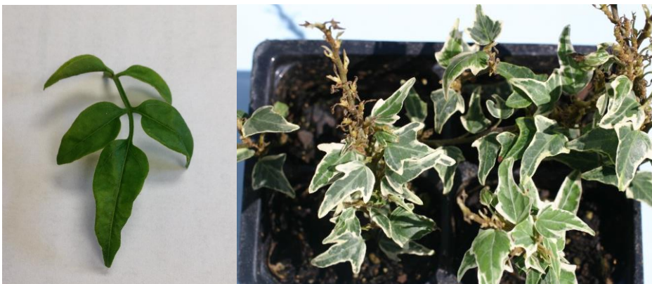
Figure 7 & 8: Feeding damage to jasmine and ivy.