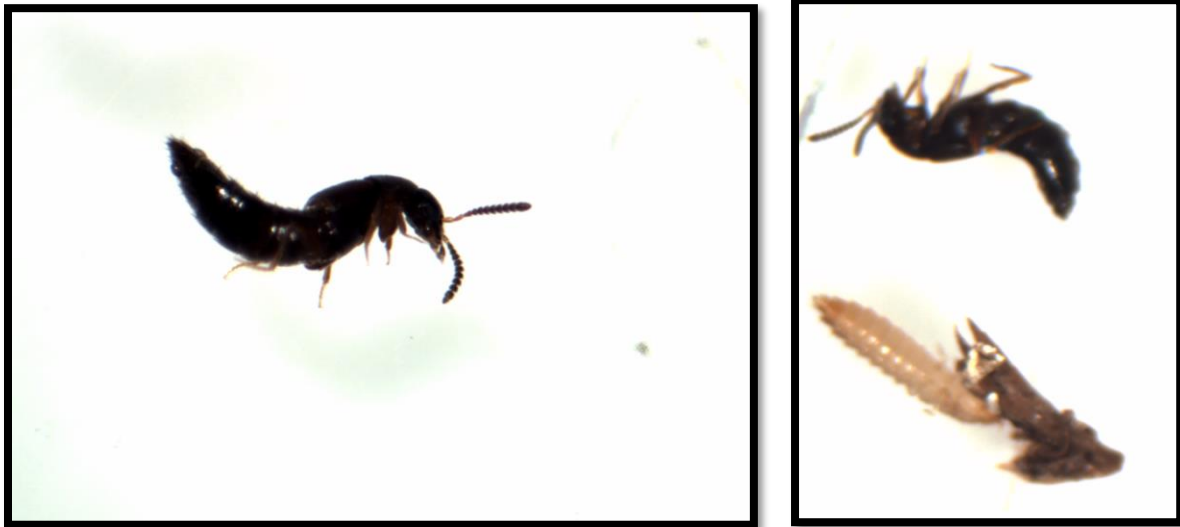
Figures 7 & 8 Rove Beetle Adult (left) and adult compared to larvae (on right).

Adults are slender, dark brown to black hairy beetles, about 1/8 of an inch long, with short wing covers that are less than the length of their body. Because adults can fly, this helps them disperse in the greenhouse from the release sites. Larvae are cream-colored to brown, depending upon their age. Both stages are primarily found in the growing media, especially in cracks and crevices. Once established in a greenhouse, they will be there year-round, but population levels vary depending upon fungus gnat populations.