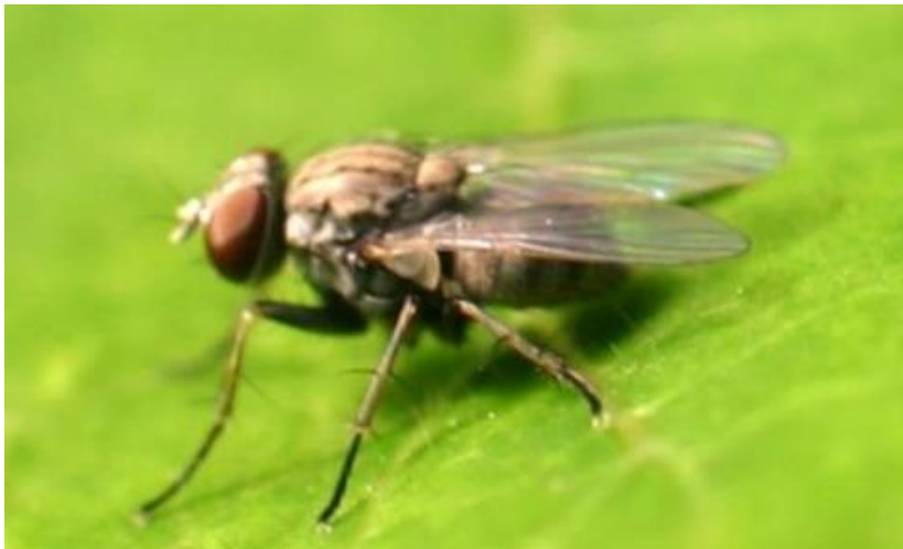
Figure 11: Close-up of adult hunter fly perching on a leaf.

Growers may notice hunter flies ( Coenosia attenuata ) on their yellow sticky cards. Hunter flies may be introduced into your greenhouses on new plant material. The hunter fly is in the same family as a housefly but is smaller. Hunter flies may be confused with shore flies, but hunter flies are about twice the size of shore flies. They also have wings that are clear and may appear iridescent as the hunter fly adults perch on plant leaves, pipes or other objects in the full sun. The female has a dark gray body with black legs while the male has yellow legs. These aerial predators will catch fungus gnats or shore flies on the wing. Adults lay their eggs in the growing media and their larvae prey upon fungus gnat larvae and shore flies in the growing media.