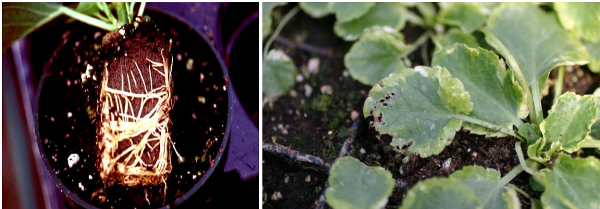
Figures 5 & 6 Fungus gnat feeding damage to poinsettia plug (left) and signs of larvae feeding on leaves (right).

Place potato chunks or plugs on the media surface to attract larvae. Inspect potato slices after 2 days. Inspect root systems for overall health and for signs of damage from fungus gnat feeding (blunt root tips).