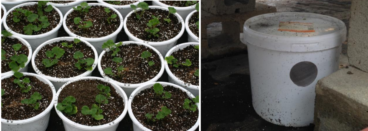
Figures 9 &10: Application of Rove Beetles in piles (left) and breeder bucket system (right).

beetles are commercially available as adults and larvae mixed in inert material. One supplier sells a breeding bucket system for the rove beetles, which consists of media, beetles and a supplier food source. Exit holes allow the beetles to exit into the greenhouse. These buckets are placed in shaded areas under the greenhouse benches. Growers can also make their own rearing systems. (See reference regarding on farm rearing).