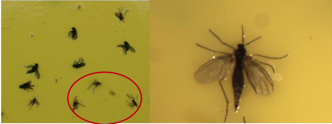
Figures 3 & 4: Adult fungus gnats on sticky card.

Check yellow sticky cards weekly. For more see: Identifying Some Pest and Beneficial Insects on Your Sticky Cards on the UConn Greenhouse IPM website.