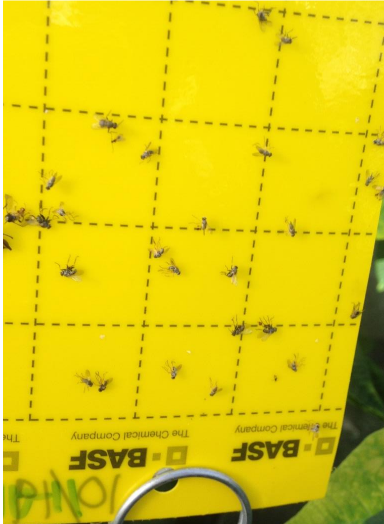
Figure 12: Adult hunter flies on sticky card.