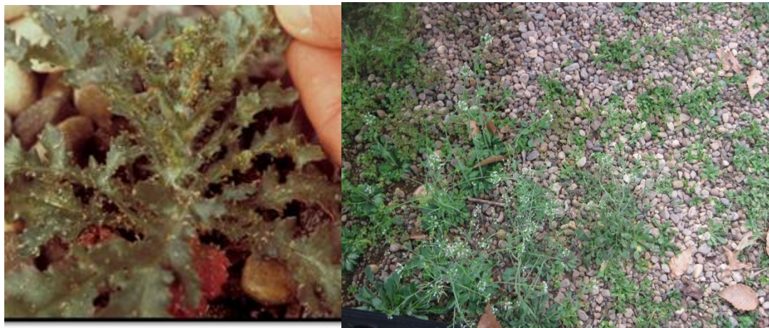
Figure 1: Aphids on weeds growing in gravel mulch.

Remove all weeds that will harbor aphids, two-spotted spider mites, thrips, and whiteflies. Take the time to remove weeds hidden behind furnaces and along the greenhouse sidewalls. It is also a good time to repair any tears or holes in weed barrier mats. Do not add stone or gravel over landscape fabric. The gravel traps spilling potting media providing an ideal environment for the growth of weeds.