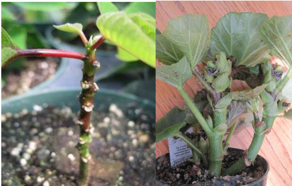
Figure 3: Phytotoxicity damage to poinsettia and begonia from chlorine bleach.

Sodium hypochlorite can also be phytotoxic to certain sensitive plants, such as poinsettias and begonias. Walks, benches, tools, and plant containers can be treated in nurseries.